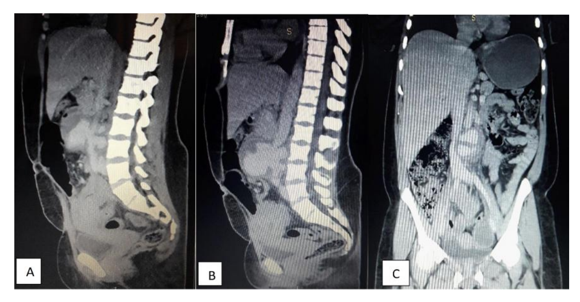
Figure 2 : (A&B) Sagittal views of contrast enhanced CT of the abdomen (arterial phase) of a 37-year-old female showing multiple anterior and posterior saccular aneurysms. The eccentric filling defect on the anterior aneurysm is a thrombus. (C) Coronal view shows the compression of the inferior vena cava by an aneurysm

Imaging plays a vital role in the diagnosis and follow up of patients with aortic aneurysms. It can also give a clue to the risk or causative factors. US is usually the cost-effective initial imaging modality used in diagnosis of aneurysms as seen in this patient, it is safe and widely available<sup>9</sup>. Cross sectional images like CT and MRI are integral component in the diagnosis, follow up and management of AAA<sup>1</sup>. In this patient, US was able to demonstrate the aneurysms, the intraluminal thrombus and turbulent flow on Doppler interrogation. The abdominopelvic CT done, better demonstrated the aneurysms as regards their exact locations, proximity to each other and size measurements. It also helped to rule out atherosclerosis in this patient, however, the